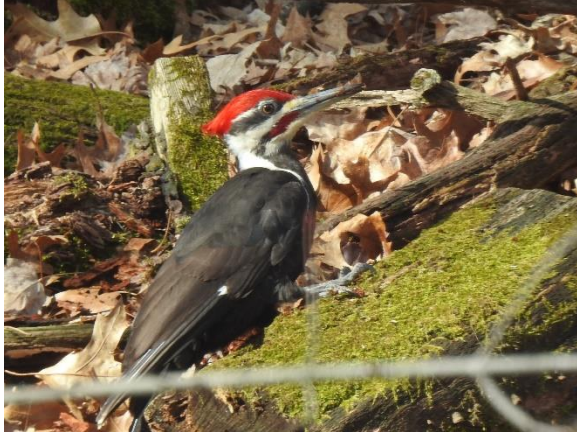
Pileated feeding on the ground

be seen feeding on the ground foraging for bugs especially on down logs and trees.