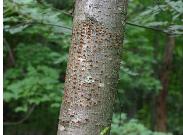
A Yellow-bellied Sapsucker's work

One thing is for sure, you can't miss their work on a tree. If you see this, you know they are in the area.