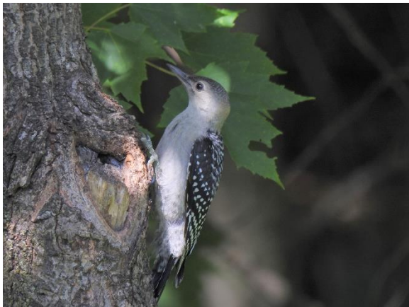
An immature Red-bellied Woodpecker

One might think the Red-bellied is misnamed because it is hard to see the red belly unless you are relatively close.