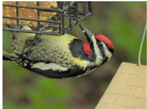
Yellow-bellied Sapsucker enjoying suet

You don't often see the yellow belly on the Sapsucker. They're usually sitting motionless against a tree. The one below gave me a really good look at that yellow belly! As you can see, they are quite fond of suet. They visit our suet feeders, pictured below, regularly when they are present.