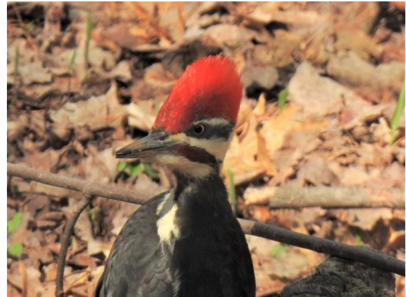
Pileated Woodpecker with the bright top knot

almost thirty inches and sports a bright red top knot.