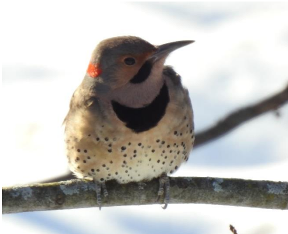
Northern Flicker in January 2022

Sometimes Flickers will overwinter here. The bird pictured below spent the entire winter of 2022 in our woods. Thanks to water, sunflower seeds, suet, and a fly through feeder with a roof for it.