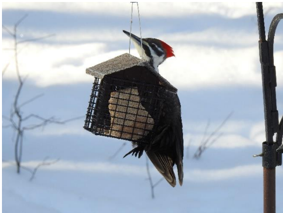
As big as the suet feeder

They will also frequent a suet feeder year-around. I had to rethink the use of a wooden suet feeder. I had a lovely homemade wooden suet feeder that a Pileated reduced to a pile of wood chips. Perhaps it was upset because I forgot to fill it with suet.