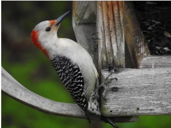
Red-bellied at the fly-through feeder

Red-bellies are quite abundant here and are easy to bring to bird feeders. They love suet but will also come to sunflower seeds.