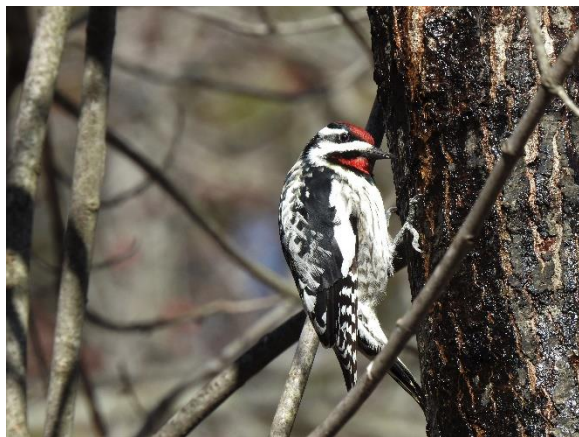
Yellow-bellied Sapsucker eating sap from this tree

The Yellow-bellied Sapsucker is primarily a bird of the Eastern U. S. and breeds into the far north of Canada. Most sources show our area as the Southern end of the breeding area. They migrate to the Southern U.S. and beyond in the winter. They are fairly common in Kinnickinnic Township.