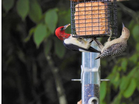
Red-headed (L) enjoying suet with an immature Red-bellied

A lucky Kinnickinnic Township birder had this Red-headed visiting the feeder regularly.