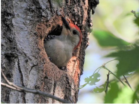
Red-bellied leaving the nest cavity in an Oak tree

Red-bellies are quite abundant here and are easy to bring to bird feeders. They love suet but will also come to sunflower seeds.