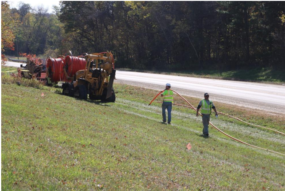
Fig. 1: Burying fiber

The project is expected to begin construction next year with planning and initial make-ready work to begin later in 2022. PPCS have already begun the initial construction in the Town of Kinnickinnic this year, expanding their coverage area from the south (Town of River Falls). You may have seen work crews along the roads, burying orange plastic tubes that house the fiber optic cables.