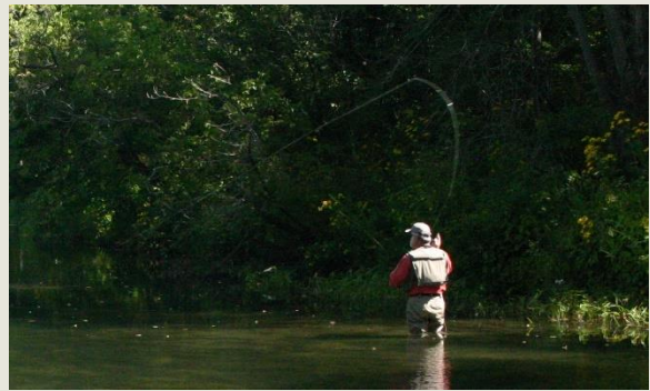
An Angler Does Battle with a Trout

encountered a watercress-choked tributary. I took one step forward, sank into its marl bottom and felt ice cold water pouring into the leg of my wader. It was so cold that I wondered how it could be liquid. I recovered as best I could and continued upstream. I'd never been in a stream so clear that at the same time had large weed beds in it. I learned later that the weeds weren't weeds at all, but instead were plants such as Ranunculus and Elodea , both indicators of high water quality and well-adapted to coldwater environments. Further upstream I found a patch of white sand bubbling underwater. That, I learned, was a submerged spring. Those were some of the first things I learned about on the Kinnickinnic, but not nearly the last.