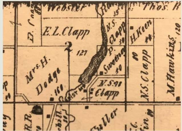
1876 Plat Showing Clapp Dam in Section 2 of the Township