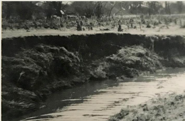
An early picture showing severe bank erosion on the Kinnickinnic River

In the 1930's the first Wisconsin Conservation Dept. fishery survey on the upper Kinnickinnic River showed that the trout population was greatly reduced by habitat degradation, siltation, overgrazing and severe bank erosion. Cattle could be