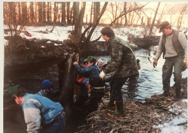
A KIAP-TU=WISH work crew doing winter "grunt work" on a section of the Kinnickinnic near Hwy. 65 1985