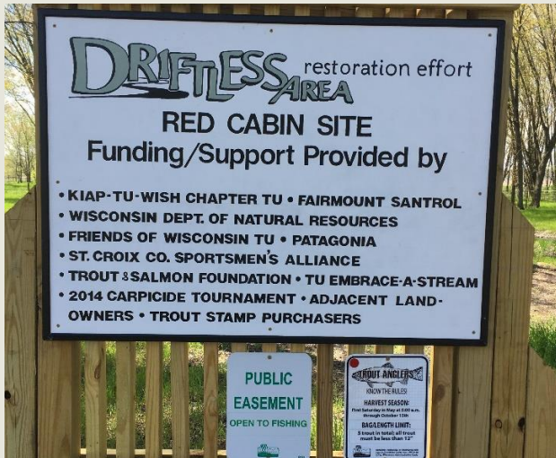
The Sign at the Red Cabin Site