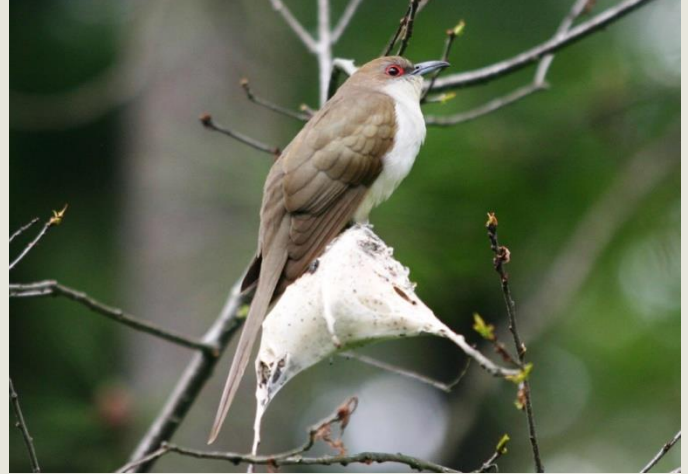
Black-billed Cuckoo sitting on a caterpillar "tent" dining on caterpillars

website, you can easily access virtually any bird call. You can then record bird calls for use in the field. I record an unfamiliar call while in the field to make later comparison should I not spot the critter. Add a pair of binoculars and you are a birder!