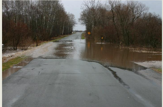
Ted Creek on 4/17/2019

Even tiny little Ted Creek (normally 2 feet wide) that runs under River road just before County JJ rose well over the road.