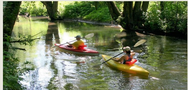
Enjoying a float on the "Kinni" in our Township

There is some conflict between anglers and Kayakers. Approaching kayaks disrupt the angler's fishing by scaring feeding trout. Fortunately, during the summer, angling for trout is best done quite early and then later in the day when anglers might likely find themselves alone on the river. It is important to remember that we all have equal rights to use the resource.