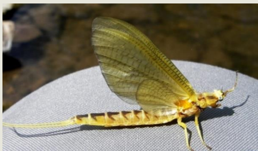
The Hexagenia limbata Mayfly – Photo TA ACTUAL SIZE

In his 1993 book, Kinnickinnic Years , John Prucha writes, " It is an impressive insect. The head and body – never mind the tail – antenna, and wings are 1 ¼ to 1 ½ inches long. When you see one flying at dusk you'd think it might be a butterfly. They hatch from nymphs under water and pop up to the surface as if they were oiled. They float briefly, then fly off and roost on bushes to molt again. They mate, lay eggs (in the stream) and die. All stages are usually present in a given evening. Sometimes there are four or five shads on each square foot of water and eight or ten big trout vigorously working. This fly is big and meaty enough to interest the largest minnow-eating old brown trout that may not bother with insects at any other time. They are big enough to use as bait ".