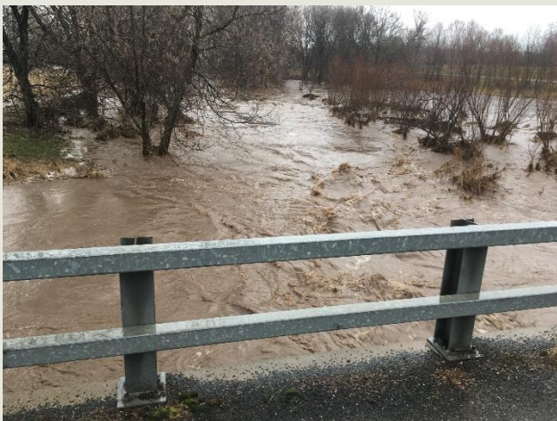
At flood on 4/17/2019

Even tiny little Ted Creek (normally 2 feet wide) that runs under River road just before County JJ rose well over the road.