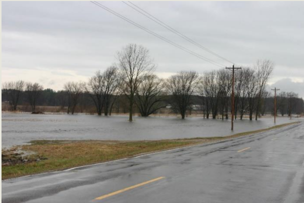
Parker Creek (over the road) at Cty. Rd. J on the Eastern Boundary of Kinnickinnic Township 4/17/19

The quiet little tributary that runs under the small spur (30 th ) between Highway 65 and North River Road was extremely high.