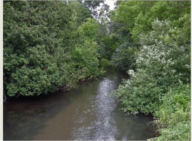
The present day Kinnickinnic at Cty. Road J

Lower. "If it were not for the fact that they are connected, you might mistake them for separate streams" . (J.R. Humphrey) Most of the upper river lies within our Township and is a narrow, sandy rubble bottom river meandering through farm country. The lower river is much different.