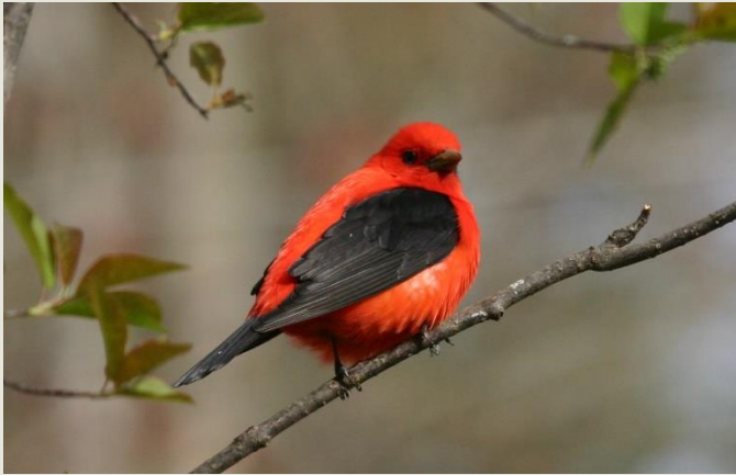
Scarlet Tanager

The Scarlet Tanager does nest in Kinnickinnic Township. Since I spotted and tracked the first one a few years back, I have observed them nesting every year. Usually about the time I'm sitting under a tree calling Tom Turkeys or searching for Morel mushrooms (late April through mid-May) the Tanagers show up.