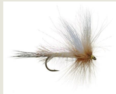
A typical fly angler's imitation

Trout anglers usually had their special flies to imitate that mayfly. Trout relished