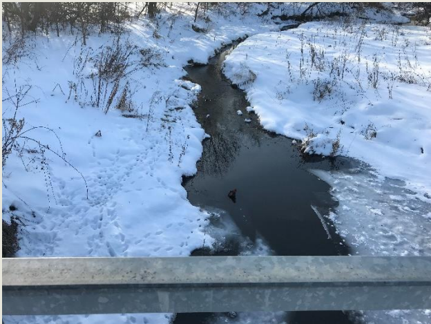
The small tributary prior to high water

The quiet little tributary that runs under the small spur (30 th ) between Highway 65 and North River Road was extremely high.