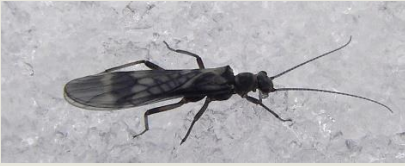
The winter stonefly shown here resting on the ice.

sizeable morsel. The river above and below the Liberty Road bridge is a great place to find these insects.