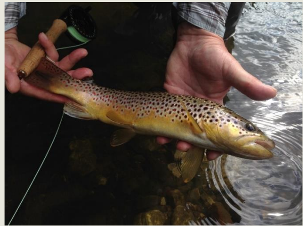
Brown Trout ( Salmo trutta ) – A local specimen

Brown Trout are not native to North America. They were first brought to the United States in the 1880's from Germany. They were first stocked in the Kinnickinnic River in the 1930's. Brown trout have almost completely displaced the Brook Trout in the Kinnickinnic River except in the very upper reaches of the river and in a few of the tributaries.