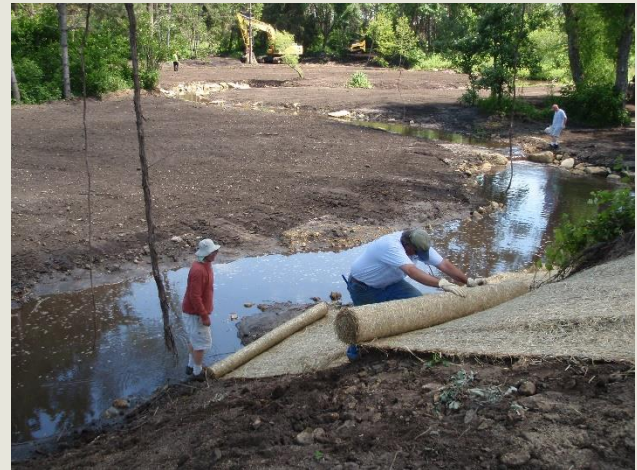
WIDNR and volunteers work on the Parker Creek Project

KIAP-TU-WISH, has been involved in projects on the Kinnickinnic for almost fifty years!