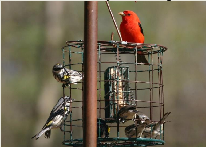
The Scarlet Tanager sharing the suet with five Yellow-rumped Warblers

Tanagers are berry eaters, however, like most species of birds they are opportunistic. I experienced this first hand one spring when a Tanager arrived quite early. He found the suet to be a fine substitute for the blackberries and raspberries that were more than a month away from showing.