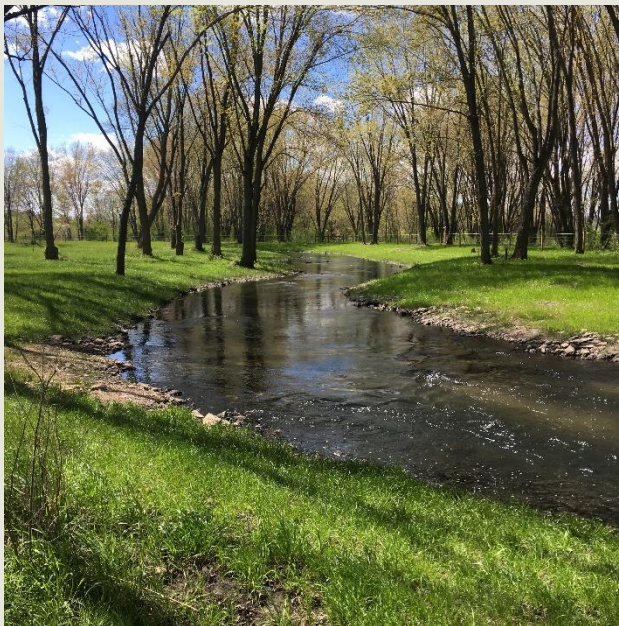
The Completed Red Cabin Site Photo – TA

Another important project involved the largest tributary of the Kinnickinnic River, Parker Creek. Parker Creek originates just above County Road W just outside the boundary of Kinnickinnic Township. Just before County Trunk J, Parker Creek enters our Township. With the support of local land owners, extensive restoration work has been completed starting near County Road J all the way to Pleasant Avenue.