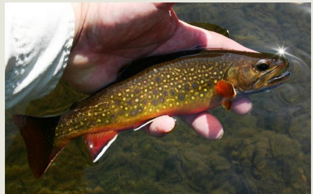
Brook Trout ( Salvelinus fontinalis ) – A local specimen

The two main players in the angling history of our river are the Brook trout and the brown trout. Brook trout are native to eastern North America from Hudson Bay to the Appalachian-Mountains and westward through Michigan to Minnesota.