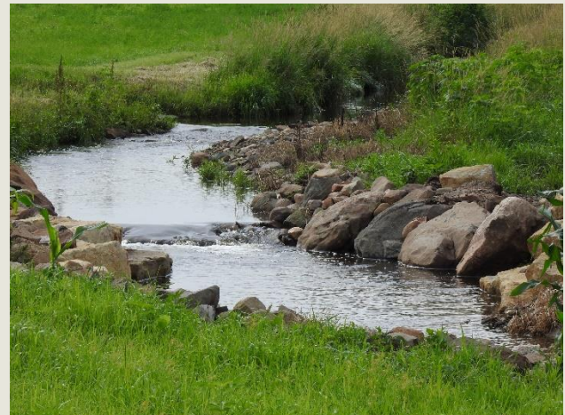
A beautifully restored portion of Parker Creek