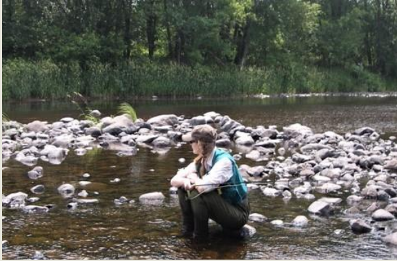
The Author's Daughter Enjoying the River

I am also reminded of the many deep and lasting friendships I was fortunate to find among my fellow volunteers in the winter and among anglers I encountered in the summer months.