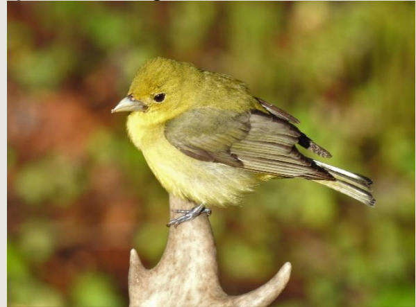
Female Scarlet Tanager

their own. The Cowbirds always seem to show up pretty early seemingly scouting out who might be a suitable nest builder for their eggs. Every year I see the wrong bird species feeding Cowbird chicks.