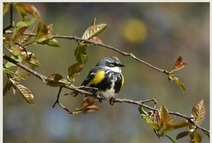
Yellow-rumped Warbler

One of the most common migrating Wood Warblers that pass through the Township is the Yellow-rumped Warbler.