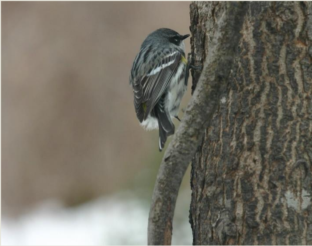
A Yellow-rumped Warbler dining on maple sap during a rough patch of spring weather

Another common spring migrant is Old Sam Peabody . Well, the real name is the White-throated Sparrow. Depending on the year, they can be seen usually from early April well into May.