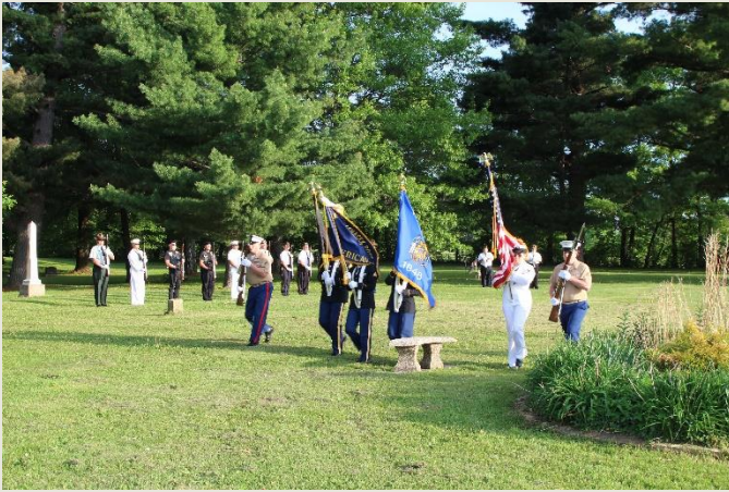
Annual Memorial Day Service at Kinnickinnic Cemetery Staff Photo

Behind the flag pole is an interesting angel statue. A white pine stood in this location and in 2003 it was hit by lightning. Steve Cudd had the idea to carve an angel out of the remaining wood. Gary Betlack carved this beautiful statue and it was placed on the stump of the pine tree. A Christmas tree ornament was used as a model for the statue. Presently if you knock on the base you will find it is now made of cement.