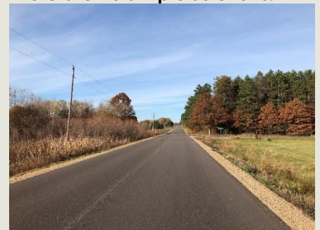
Liberty Road Reconstructed

Why is it hard to fund road projects on a Township level? As previously noted, roads account for a very large part of the Town's annual budget. Funding for our Town roads comes from one of two places; the Town budget (property taxes) and State aid. Some of the ideas for increasing funding for the State General Transportation Aids include raising the gas tax, switching to a mileage-based system for car registration fees, increasing registration fees on commercial vehicles, increasing driver license fees, and eliminating certain tax exemptions on trade-ins. There are no simple solutions.