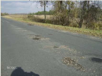
Liberty Road was in tough shape

Liberty Road was the top priority on the Town's six-year road plan. SEH prepared a grant application to the State of Wisconsin Town Road Discretionary Improvement Program (TRID). The Town was successful in obtaining a grant for 50% of the cost of the project. In 2014 the Town began working on the planning of the project. A topographic field survey was completed of the roadway and soil borings were obtained. Concept plans were then prepared to study several options