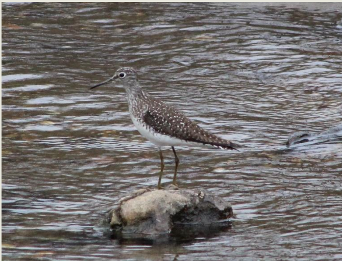
A Solitary Sandpiper works the waters of Kelly Creek

Besides the WDNR and Kelly Creek properties there are a significant number of easements along the Kinnickinnic River and Parker Creek that are available for public use. (Public Lands Atlas) An 80-acre St. Croix County Forest property in the Township is another property open to the public. That property is primarily White and Red Pine with some hardwoods and brushy areas. A nice trail starts from the parking area on Evergreen Drive.