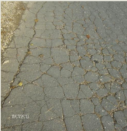
Liberty Road - Alligator Cracking

This cracking suggests reconstruction will be necessary