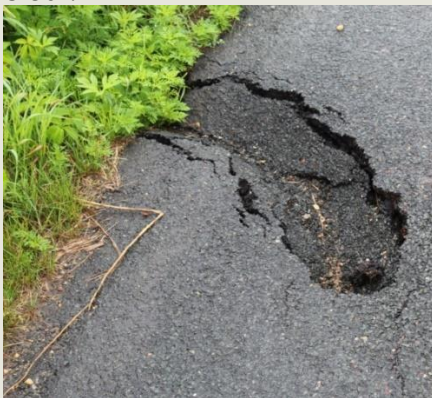
Road Shoulder Damage This is most likely gopher damage

Other basic road responsibilities include snow removal and sanding in the winter and right-of-way maintenance. The Town right-of-way is 33 feet either side of the center line of each Town road. Removing woody vegetation from this area and mowing are important safety issues. Visibility at intersections and feeder roads needs to be maintained. Animals, especially deer, are more visible as they approach the road if rights-of-way are kept clear.