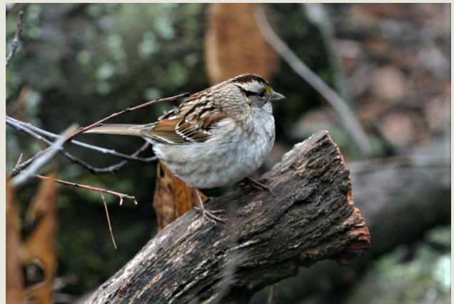
Individual bird species can vary a great deal. Here's the White-throated Sparrow that is most likely an adult tan version.

Get out this spring! Kinnickinnic Township is a great birding destination. If you don't have a woodlot of your own, there are hundreds of acres of public land in the Township and a beautiful trout stream running right through it!