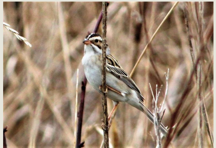
Clay-colored Sparrow - Prairie Restoration Kinnickinnic Township

(The Sibley Guide to Birds) (WDNR Endangered and Threatened Species Laws & List)