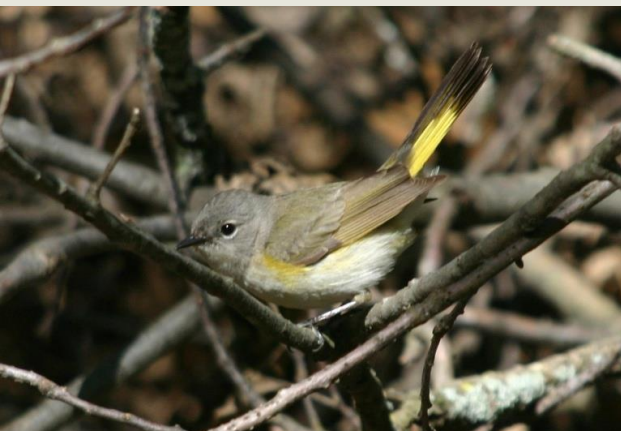
American Redstart (Female)

I'd like to think that very same bird has flown 1900 miles just to visit me again here in Kinnickinnic Township. The summer range of this little Wood Warbler includes Kinnickinnic Township. A likely spot to find this bird would be along our very own Kinnickinnic River.