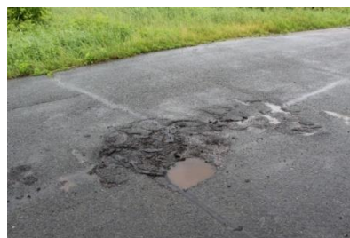
Town Road Pothole This type of damage would be spray patched

Town roads looking for issues and repairs that need to be addressed. After each session a summary of work to be done is compiled. Some of the needs addressed include spray patching, gravel shouldering, shoulder & slope grading, tree trimming, culvert cleaning, signage, debris removal, and mowing. Each road is given a PASER rating (Pavement Surface Evaluation and Rating). PASER uses a scale of 1 to 10 with a 1 being poor and a 10 good. Rating the road conditions helps determine the funding for road maintenance needed in the future. Examples of road issues would be potholes, cracking, or vegetation eroding the surface.