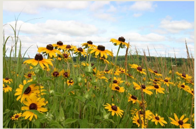
Prairie Restoration – 156 Acre DNR Swinging Gate Tract Kinnickinnic Township

The Kinnickinnic River Land Trust (KRLT) manages another important parcel, the 70 Acre Kelly Creek Property. Kelly Creek rises from springs that come out of a limestone outcropping. This can be viewed by taking the short hiking trail to that location. The spring puts out more than 700,000 gallons of cold spring water per day. Kelly Creek is then free flowing for a short distance to the Kinnickinnic River. Wild Native Brook Trout spawn there.