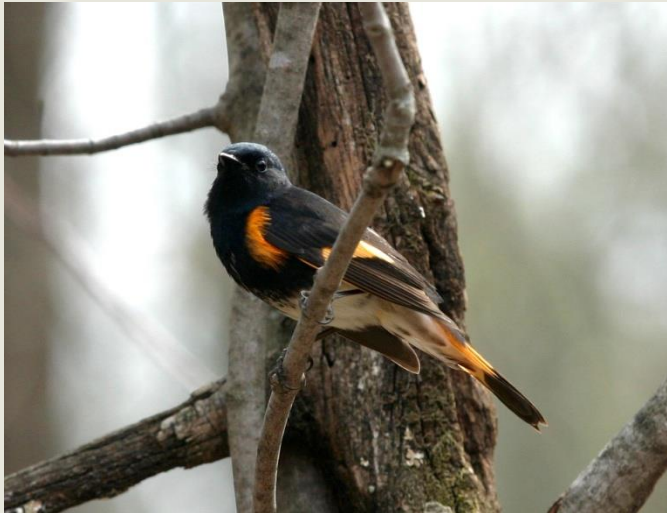
American Redstart (Male) Photos were taken in Kinnickinnic Township

When the American Redstart shows up in Kinnickinnic Township in April, I think about sitting at the Smokey Mermaid, a little open-air restaurant in Belize City. Each time I have visited that spot in the winter, this little bird has entertained me while I'm dining.