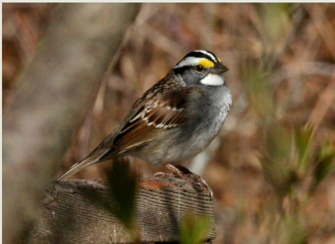
White-throated Sparrow (Adult Male)

Another common spring migrant is Old Sam Peabody . Well, the real name is the White-throated Sparrow. Depending on the year, they can be seen usually from early April well into May.