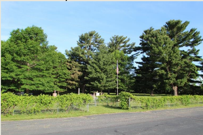
Historic Kinnickinnic Cemetery on Cemetery Road

A tour of the Kinnickinnic Cemetery, in Kinnickinnic Township, was included in the 150 th anniversary of the Kinnickinnic Church in the September 2018 celebration event. The church and the cemetery have never been affiliated with each other but there are founding members of the church buried in the cemetery giving us reason to celebrate the cemetery as well. The tour focused on the history of this cemetery, seventeen people buried there, the meanings of the headstones, and finally the importance of cemeteries and their connection to our own history.